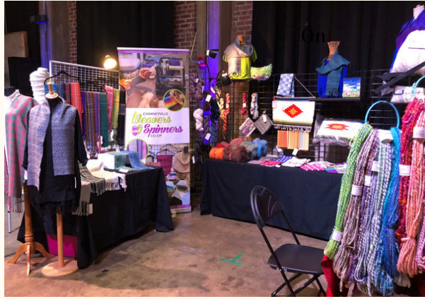
Co-op booth at 2025 Oxford Fiber Arts Festival