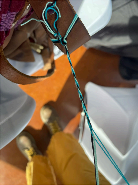
Janet's 3 strand finger woven loop braid.